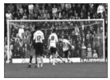
justice was done when Smith blazed it over the bar.

Schoolboy defending gifted Watford an equaliser just two minutes into the second half, a needless free-kick was given away just outside the area and the defence froze as O'Toole ran in totally unmarked at the far post to level the scores. Things nearly got worse on the hour mark when Watford were awarded a harsh looking penalty, but