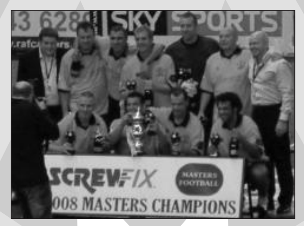
A proud moment for the team's first success in this exciting tournament