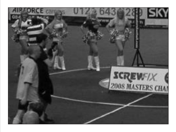
A bevy of cheerleading beauties urging the teams (and the spectators) on.