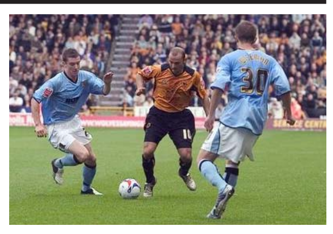
TO ELLAND BACK LEEDS UTD 2-0 WOLVES 20th August 2005

So the record run of unbeaten matches has ended at 22. It had to at some time but what a way to lose it. Having dominated the match from start to finish, the home side had two shots on target and scored with both.