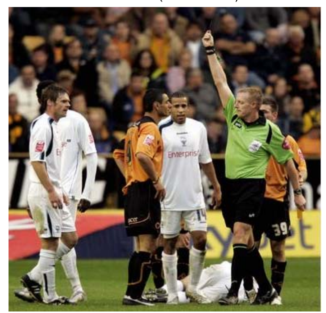
WAT A WASTE WATFORD 3-1 WOLVES 29th October 2005

This was one unbelievable match. It would be no exaggeration to say that Wolves should have gone into the break five goals to the good. Watford were reeling before Oakes made three boobs to hand the points over.