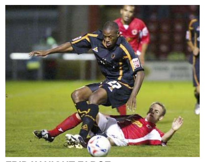
FRIDAY NIGHT FARCE WOLVES 0-1 BURNLEY 30th September 2005

Every manager in the Championship appears to have seen how Leicester coped with Wolves at Molineux and Burnley used that knowledge fully to their advantage.