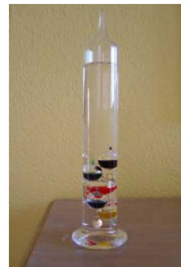
"The Chairman's Folly"